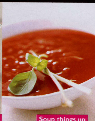
Soup things up