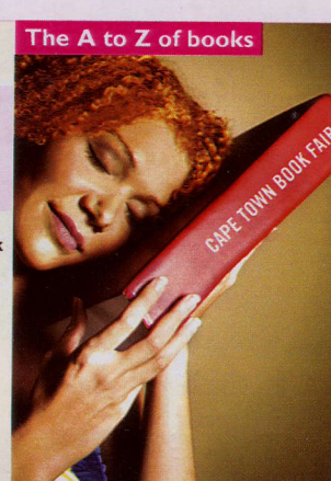
The A to Z of books