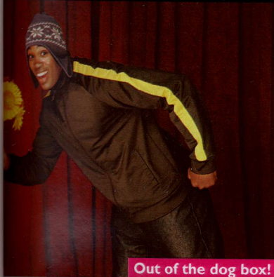
Out of the dog box!

WHAT'S UP, WHAT'S NEW AND WHAT'S UNMISSABLE THIS MONTH